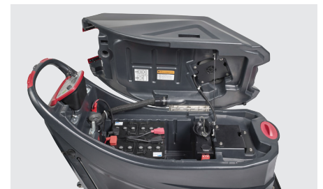
Recovery tank with hand grip for easy tilting