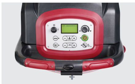
Intuitive control panel with LCD screen for all models (AS6690T/AS7690T pictured)