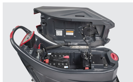
Recovery tank with hand grip for easy tilting