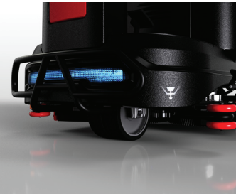
Sturdy bumper with high-visibility lights