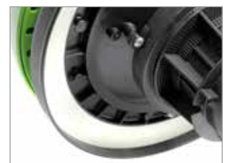
INNOVATIVE HEAD GASKET