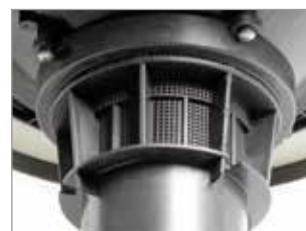
INTEGRATED ANTI-FOAM SYSTEM