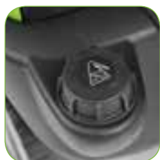
Built-in 7.5 litre detergent tank for low pressure detergent delivery.