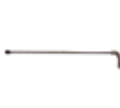
Mudguard lance Code LCPR 29360