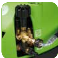
Pressure adjustment knob.