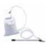
Sand bag 50 kg Code PRCH 00065