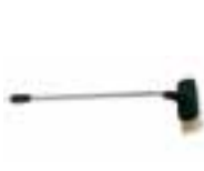
Fixed hydro-brush lance Code SPID 24939