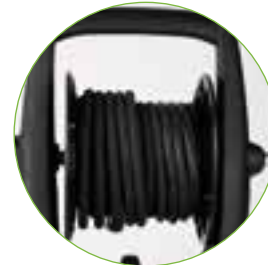
HOSE REEL with 15 m H.P. hose (optional accessory, standard in Plus models)