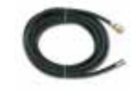
Drain Kit 10 m Code TBAP 23853