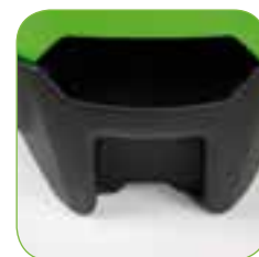
Large front foot for greater stability.