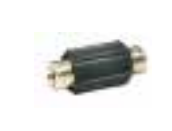
Hose couplings Code RCIN 10810