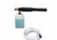
Foam head Code LCPR 24937