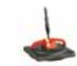
Lance for washing floors Code LCLC 49492 ● Code LCLC 49494 ■