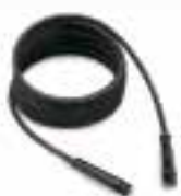
H.P. flexible hose 10 m CodeTBAP 25324