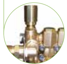
By Pass valve with pressure/flow regulation.