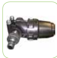
High capacity inlet water filter.