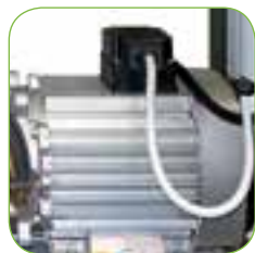
4 pole asynchronous motor for the models MLC-C 1310P M e MLC-C 1915P T. 2 pole asynchronous motor for the model MLC-C 1813P T.