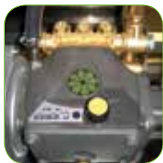
New IPC H.P. plunger pump with brass head and three ceramic pistons.