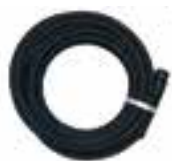
H.P. flexible hose 10 m Code TBAP 25324