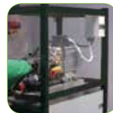
Easy access to all components for an easy maintenance.