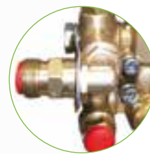
Holding metal plate to protect By Pass valve from mechanical stress.