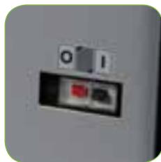
General switch with thermal protection.